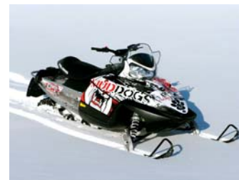
A MnUSA member will win this sled!

The winner will be drawn at the MnUSA Winter Rendezvous in February 2010, giving you plenty of time to recruit new members and associates. For more information on the Mud Dogs, visit http://mnsnowmobiler.org/index.php?pageid=487