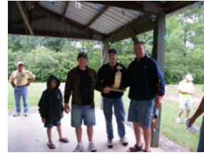
Winning team - bean bag toss

membership and directors will meet for updates on Saturday morning and the rest of the day is for fun. For campground and event registration information, go to http://mnsnowmobiler.org/index.php?pageid=481 Deadline for early registration is June 15th.